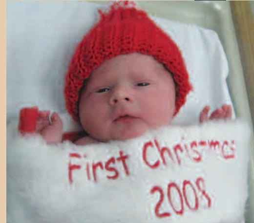
Pictured is a newborn at HCHC going home in her fleece Christmas stocking and knitted cap given by the HCHC Auxiliary.