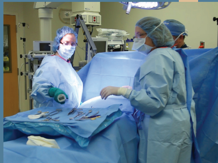
The HCHC Foundation plays an important role in provider recruitment to help ensure that local access to care continues.